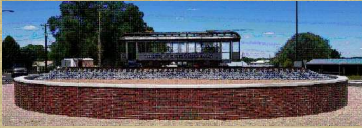
RED BRICK WALL WITH SCULPTURE, SIMILAR TO THIS IN SIZE, THAT WILL REPRESENT THAT OF THE SURROUNDING COMMUNITY.